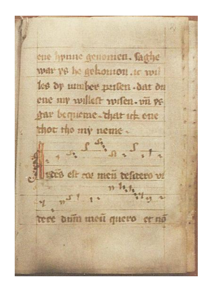
Easter Play of Wienhausen. Wienhausen, Klosterarchiv, Hs. 36, fol. 2r (late 14th century)

AN ANNOTATED MELODY EDITION OF EASTER AND PASSION PLAYS