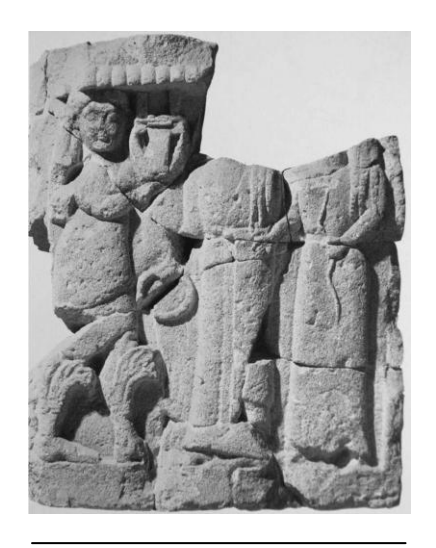
Delphic Triade: Apollo, Leto, Artemis. Museo Archaeologico di Sicilia, Palermo, Italy (ca. 540 BC)

TELESTES: MUSICS, CULTS AND RITES OF A GREEK CITY IN THE WEST