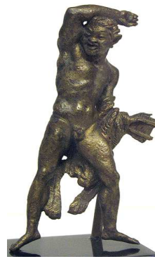
Satyr with pan pipes, bronze statuette from Pergamon, ca. 160 BC.

MACHTIGE EN MOOIE MIDDELEEUWEN (MIGHTY AND BEAUTIFUL MIDDLE AGES). De Verdieping van Nederland, The Hague. Until 8 January 2012.