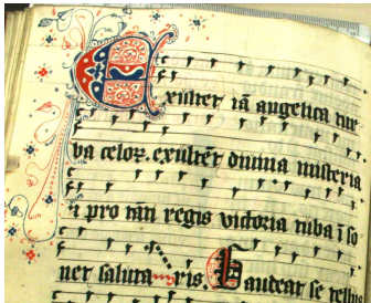
Medingen manuscript: Oxford, Bodleian Library, lat. lit. e 18. Second half 15 th century

EDITION OF A "MEDINGEN MANUSCRIPT": OXFORD, BODLEIAN LIBRARY, LAT. LIT. E 18