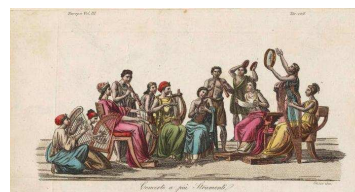
Musical Instruments in Ancient Greece. MOISA: International Society for the Study of Greek and Roman Music and Its Cultural Heritage