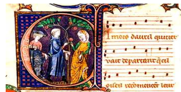
The Gothic Revolution: Music in Western Europe, 1100-1300