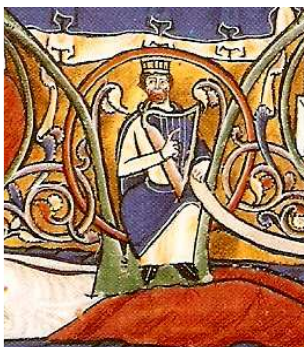
King David and the harp. Psalter, England, 13 th century. Munich, Bayerische Staatsbibliothek, Clm 835, fol. 121r

AN INVENTORY OF PUBLICATIONS (FROM C. 1800 TO 2010) ON THE ANCIENT AND MEDIEVAL HARP