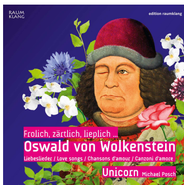
Frolich, zärtlich, lieplich: Oswald von Wolkenstein

Amours et désirs – chansons des trouvères . Ensemble für Frühe Musik Augsburg (2011). Christophorus CHE01632. € 9.90.