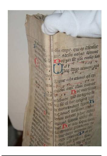
Isenhagen, Klosterarchiv, Ms. D145.

MUSIC IN MANUSCRIPTS FROM THE "LÜNEBURGER FRAUENKLÖSTER"