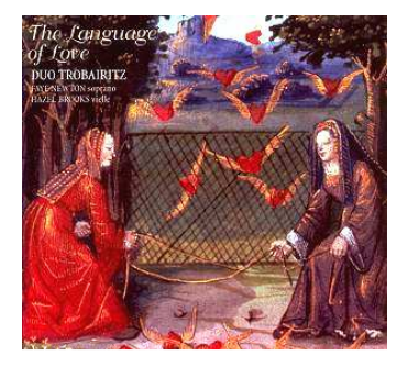
Duo Trobairitz: The Language of Love

Zur Aktualität des antiken griechischen Wissens von der Musik. Musiktheorie 22, Nr. 4 (2007). (Special issue.)