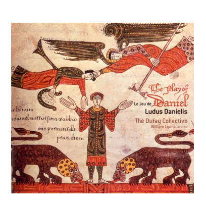
The Dufay Collective: Ludus Danielis. The play of Daniel.