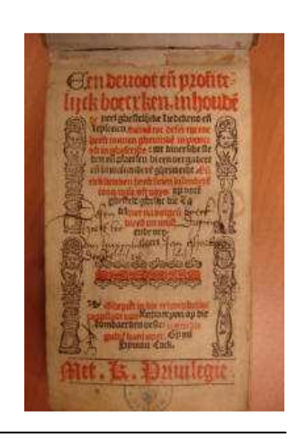
Devoot ende profitelijck boecxken, Antwerpen 1539

NETHERLANDS ORGAN-ISATION FOR SCIENTIFIC RESEARCH (NWO) HAS GRANTED A SUBSIDY TO THE PROJECT DUTCH SONGS ON LINE IN FEBRUARY 2009.