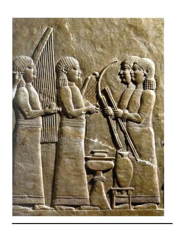
Palace orchestra of Nineveh depicting a lyre, a harp and a double oboe, ca. 704-682 B.C. London, BM, Inv. Nr. 124922