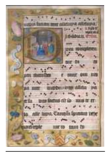
Tsgrooten Antiphoner (1522). Ghent University Library

INVENTORIES OF ANTIPHO-NERS IN FLEMISH COLLEC-TIONS