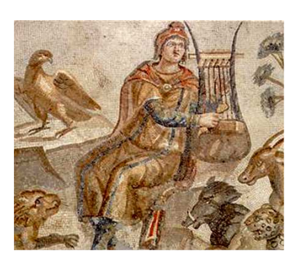
Mosaic of Orpheus playing his lyre. Tarsus, 275-300 AD. Antakya Museum, Inv. 10568. (Permission to publish the Plovdiv lyre was not obtained)

http://alamirefoundation.org/en >research >current projects >Antiphoners in Flanders