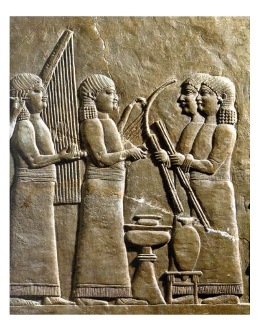
Palace orchestra of Nineveh depicting a lyre, a harp and a double oboe, ca. 704-682 B.C. London, BM, Inv. Nr. 124922

SOUND FROM THE PAST THE INTERPRETATION OF MUSICAL ARTIFACTS IN ARCHAEOLOGICAL CON-TEXT. TIANJIN CONSERVAT-ORY OF MUSIC. Tianjin, China. September 20-25, 2010.